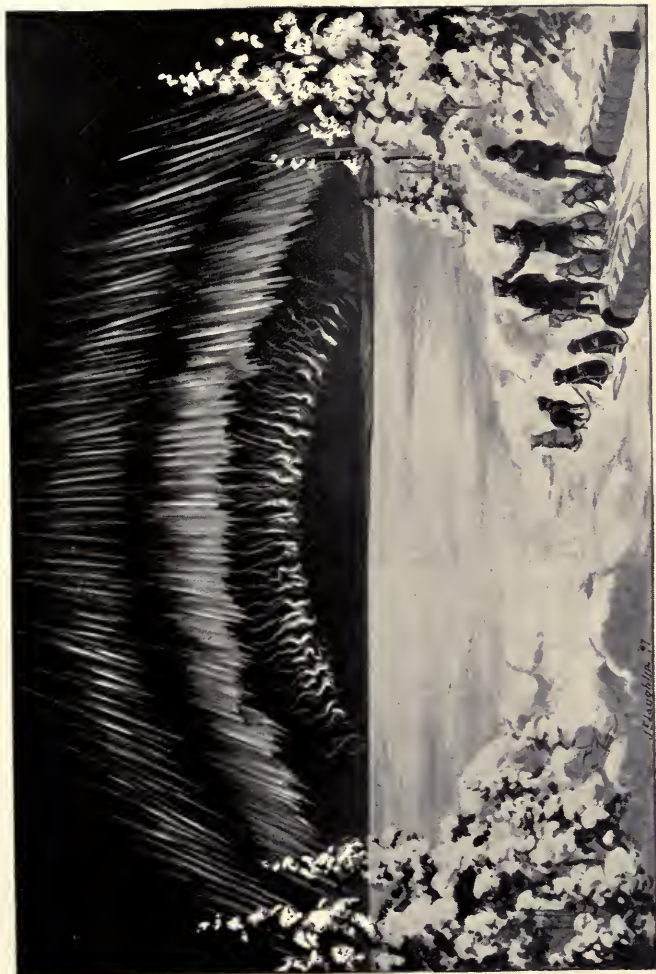
THE AURORA BOREALIS.